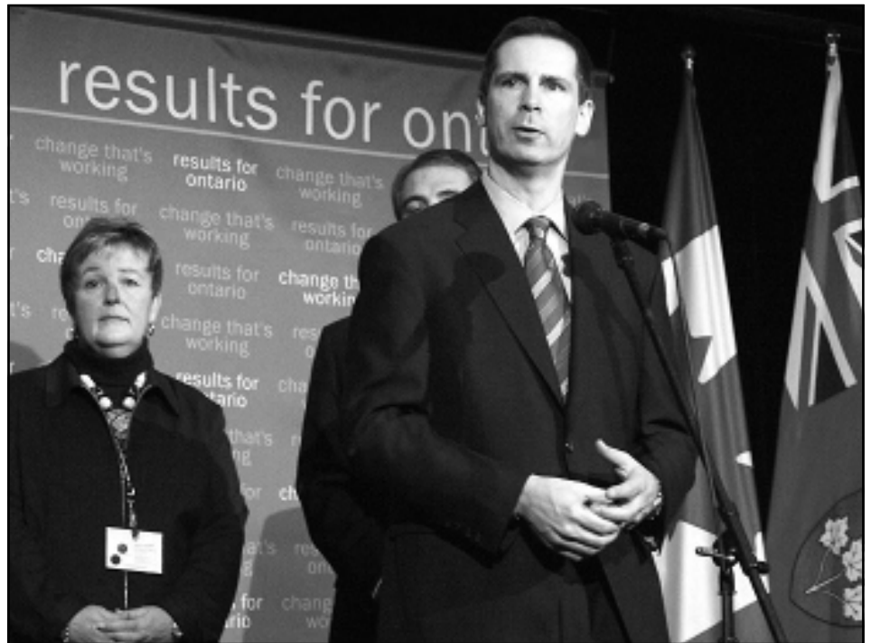
Premier Dalton McGuinty speaks at the Agri-Food Summit.

closing remarks and a “Harvest Ontario” reception was held in the Legislature.