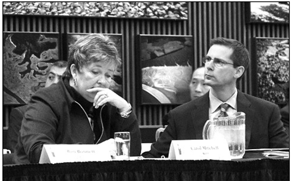
The Premier's Summit on Agri-Food